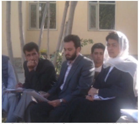
Participants at the Oct. 17 meeting in Kabul

Before proceeding with our analysis, it will be useful to ask whether there is a role for community radio in Afghanistan and whether current conditions are sufficient to justify pursuing